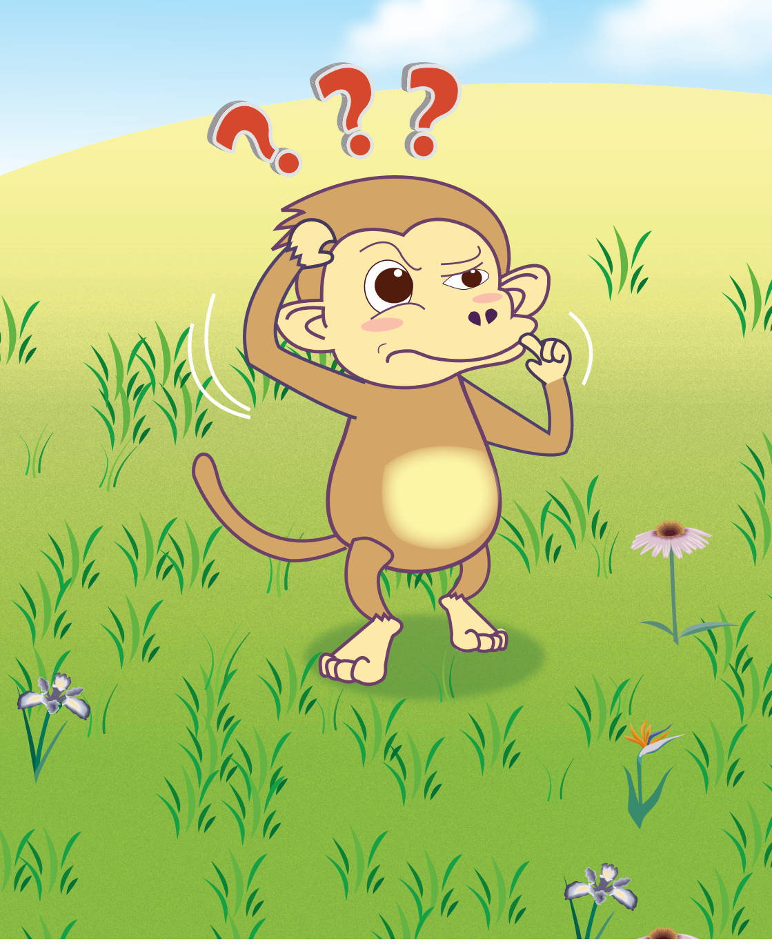
Where is the tree?