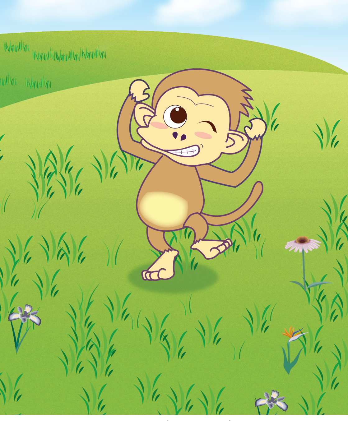
Here is the monkey.