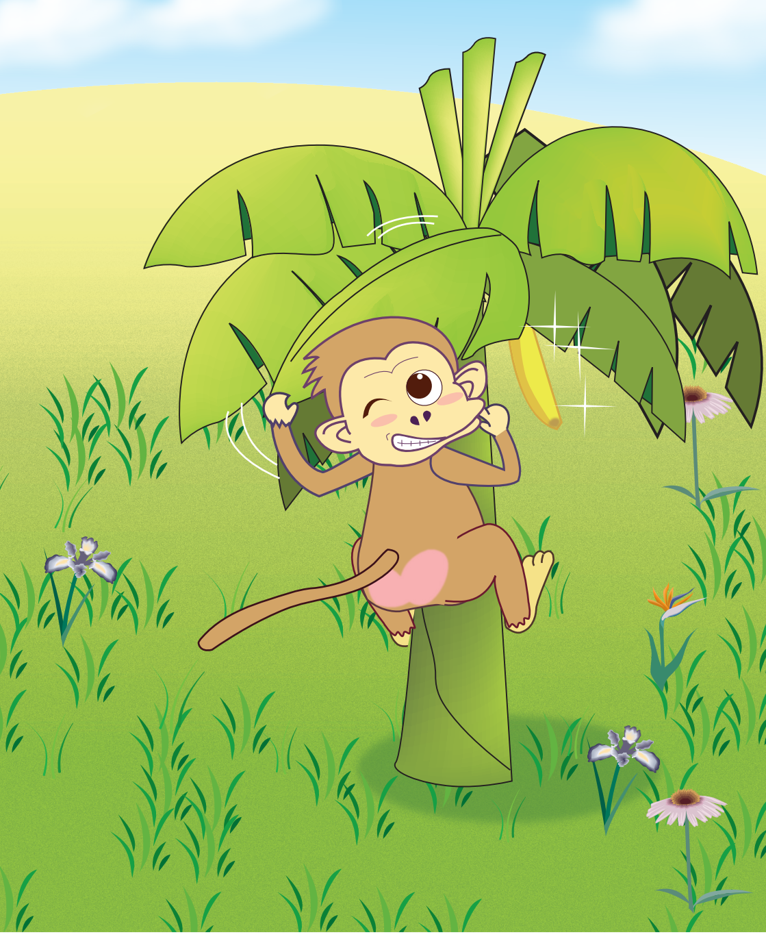
Here is the banana.