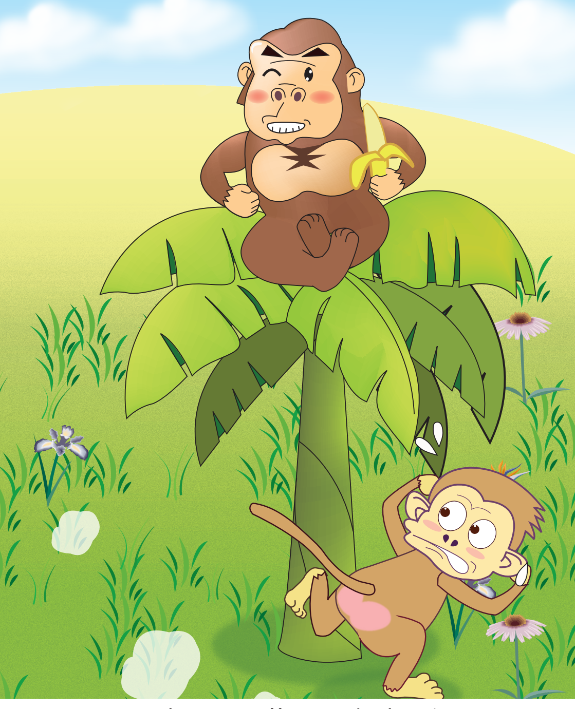
Here is the gorilla and the banana.