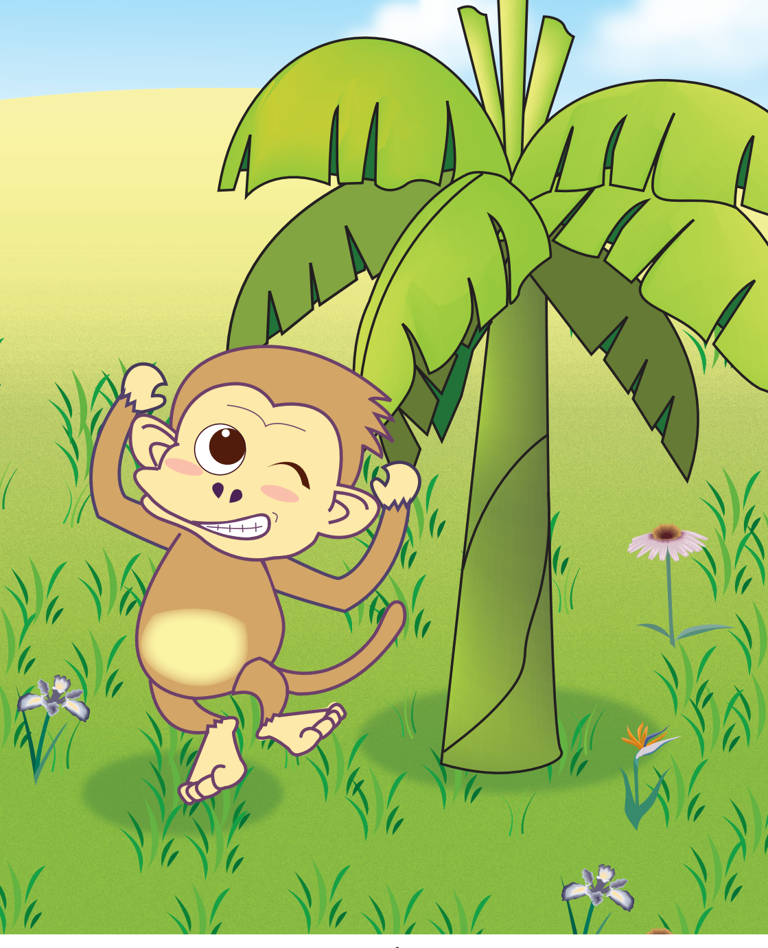
Here is the tree.