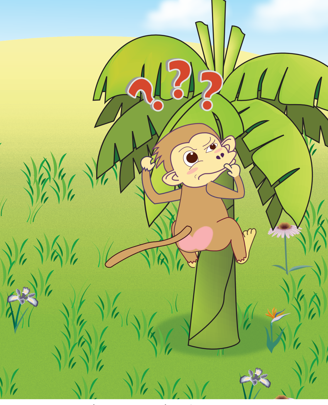
Where is the banana?