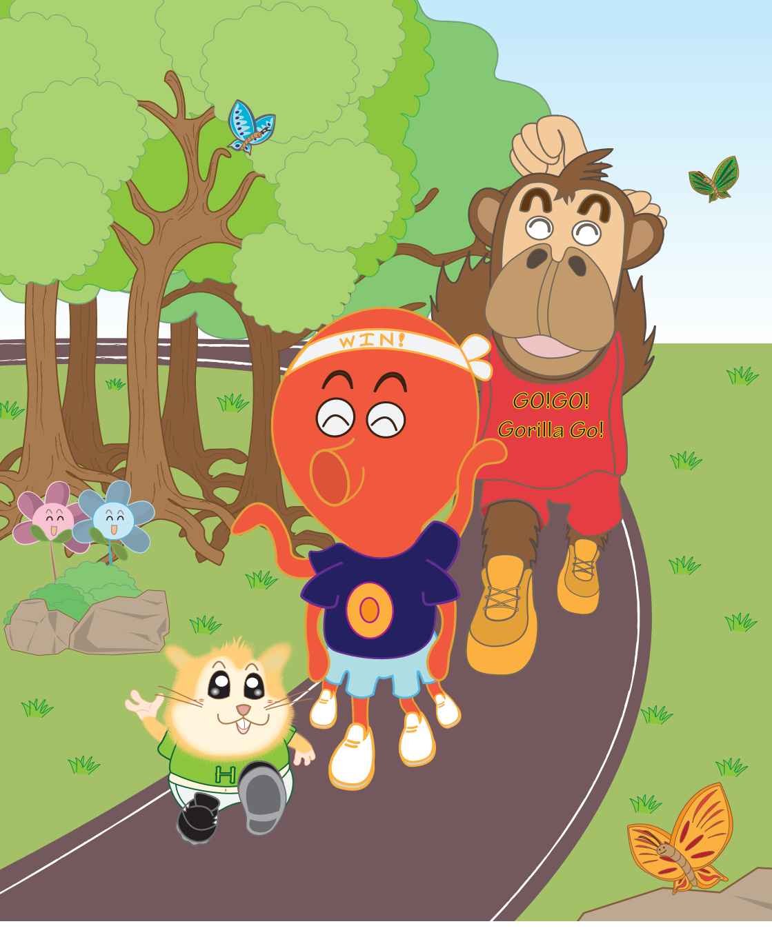
They go walking on Sunday.