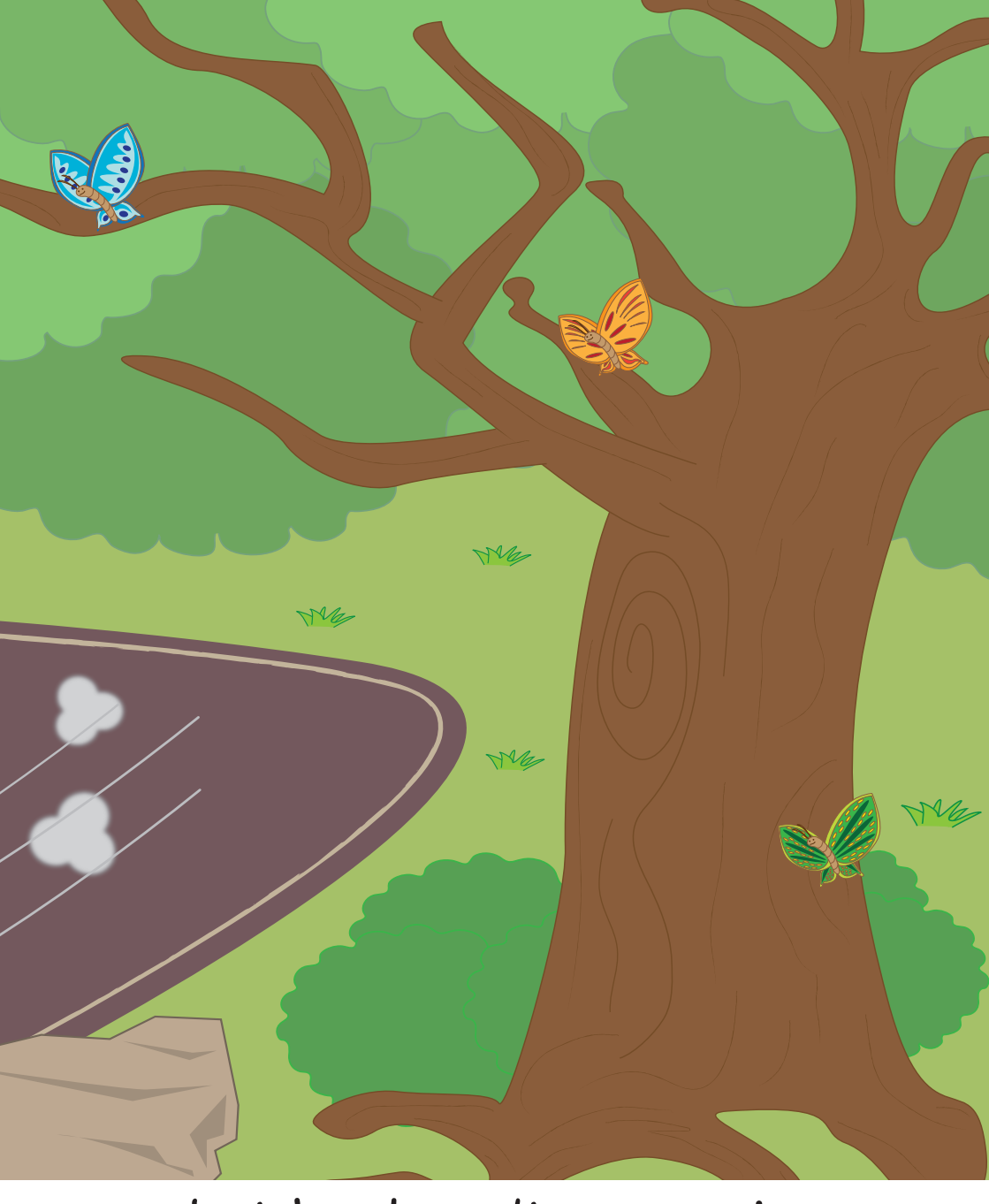
...but he doesn't go running on Sunday.